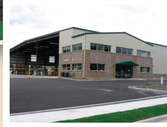
New construction in Four Corners Industrial Park.

T he Molalla Enterprise Zone provides tax abatement as a financial incentive for industrial businesses to expand their existing facilities, construct a new building, invest in machinery, and hire new employees at higher wages.